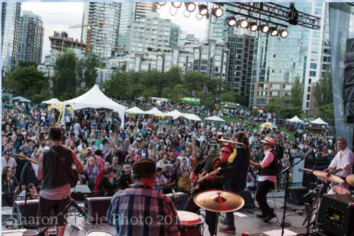
Headlining The Vancouver International Jazz Festival, David Lam Park, 2016

extensively and released numerous independent recordings including two self-titled cassettes, "Get Rooted" (also released on cassette), "What We Do", "Syzygy" and in 1997, "Rootrospective", a 16 song collection spanning their entire recording career (2nd pressing released in 2015).