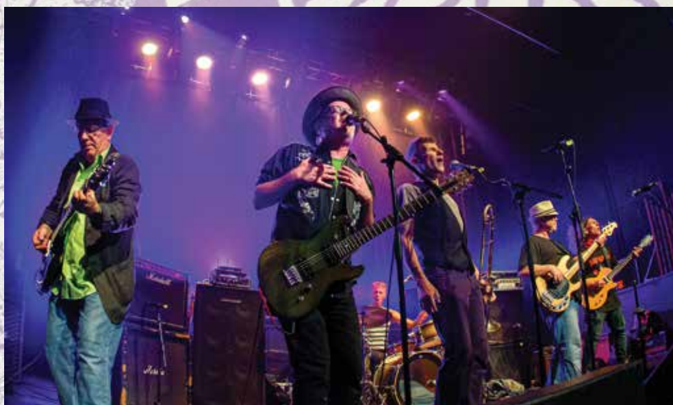
Rock Against Racism Rickshaw Theatre, June 2022